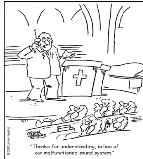
Making a Difference in the Lives of People Through the Power of Jesus Christ