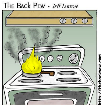
We won't ignore a small fire in our home, BUT...do we ignore the flames of anger, jealousy, or envy.

Making a Difference in the Lives of People Through the Power of Jesus Christ